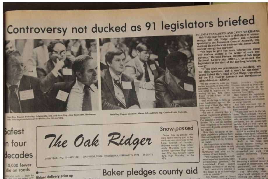
The Oak Ridger headline for February 5, 1975

Forty years ago, Oak Ridge led the way to help educate our state leaders. We have continued to produce scientific advancement in areas well beyond nuclear power to include neutron science, advanced materials research, life sciences, supercomputing, additive manufacturing, carbon fiber, isotopes, and nuclear weapons among other significant achievements. All the while continuing to be a resource to our elected officials. Oak Ridge truly is a Science City for the state, nation and the world.