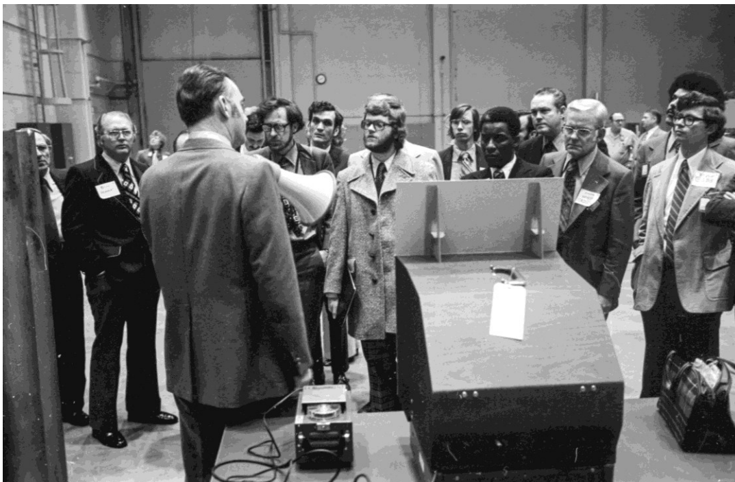
One of the briefings at the Oak Ridge National Laboratory