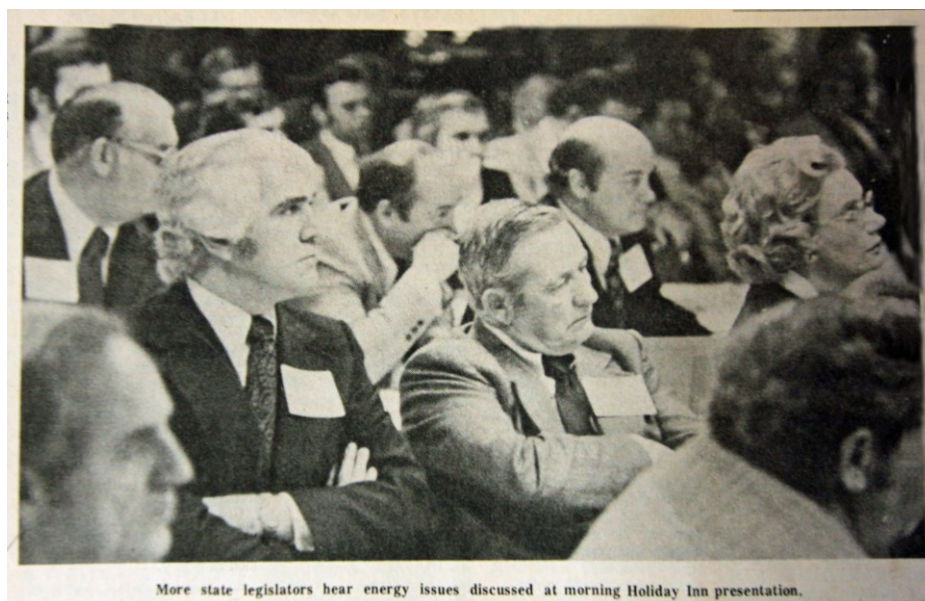
Legislators listening to Oak Ridge leaders