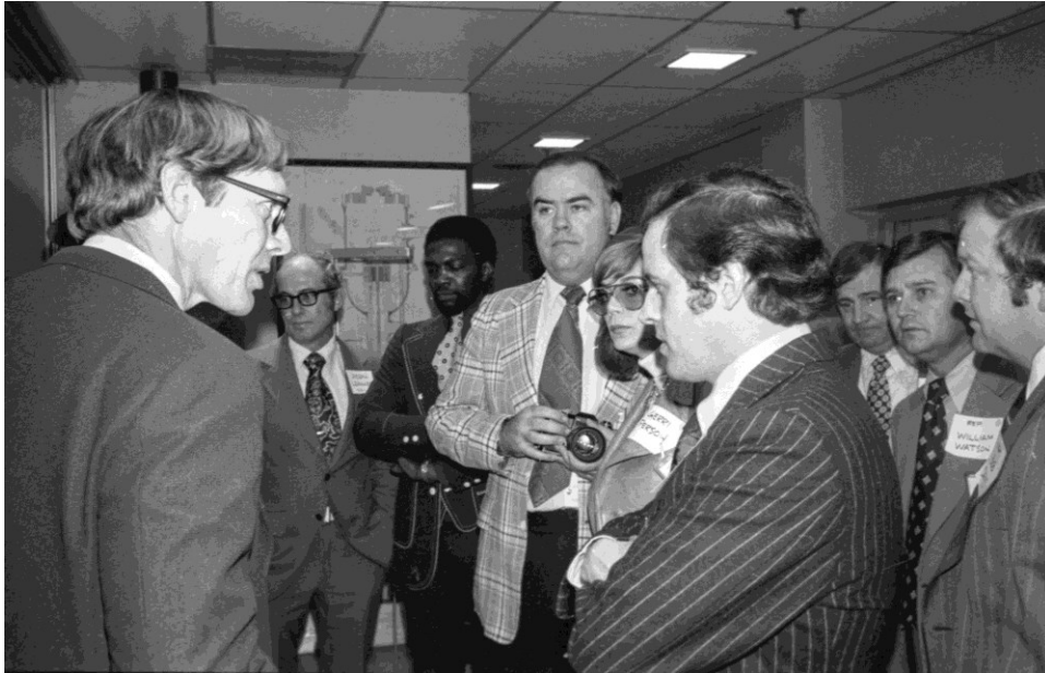
ORNL Director Herman Postma makes a point to the legislators

(As published in The Oak Ridger's Historically Speaking column on February 26, 2015)